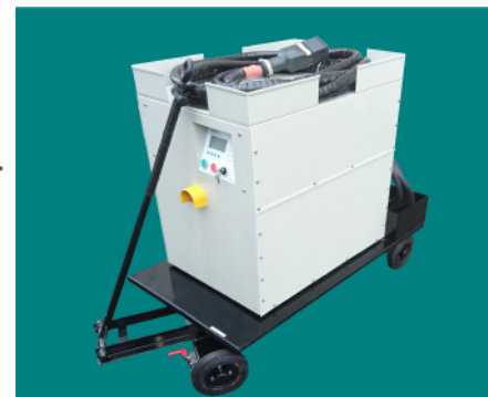
Available on all-weather hand-pull cart.

ABLE-60R models may be ordered in the standard IP31 cabinet with castors, or they may be supplied in environmentally protected cabinets up to IP54 all-weather. Other possibilities include anti-vibration fixings, hand pull carts or permanent external plinth mounting.