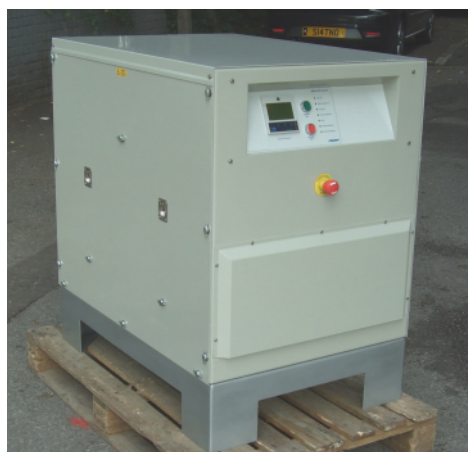
A 50KVA IP54 Plinth Mounted Reverse Converter